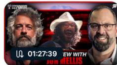
The J6 Witch-Hunt Against Trump Ramps Up Before Election Day | ... Conservative Daily Podcast A day ago · 3.8K views