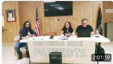
Live streaming of Northern Neck Patriots