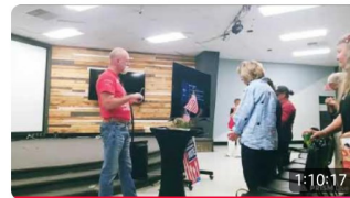
J6 Talk "God & Govt" group 10.22.24 68 views · Streamed 3 days ago

(Image taken from Northern Neck Patriots YouTube)