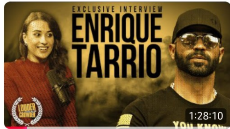
● EXCLUSIVE: J6 Prisoner Enrique Tarrío's First Sit Down Interview Since ... 126K views · 2 days ago