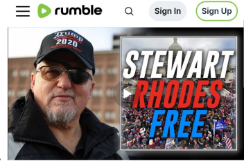
EXCLUSIVE: Oath Keepers Founder & J6 Hostage, Stewart Rhodes, Joins Alex Jones After President