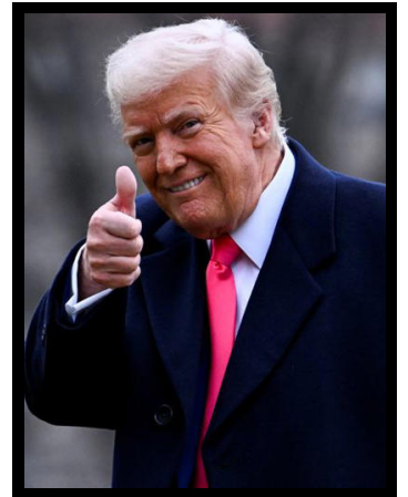
Fight Fight Fight